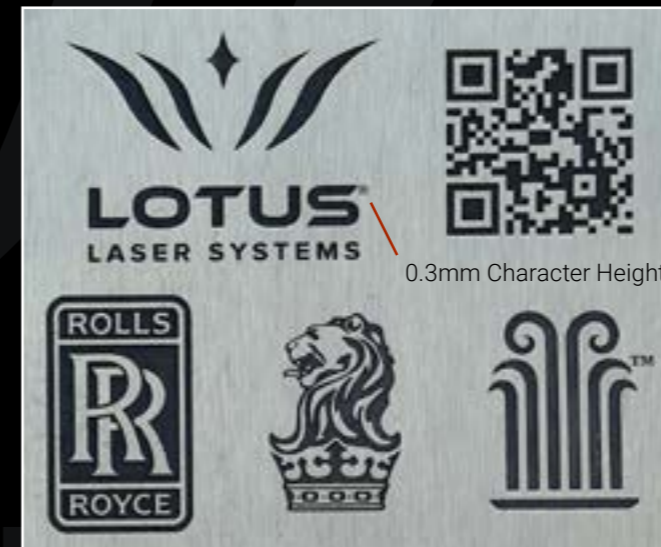
0.3mm Character Height